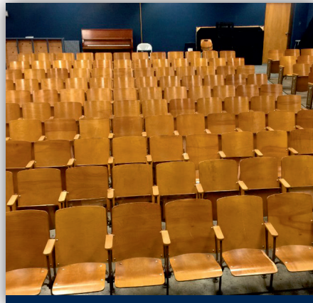
ORIGINAL SEATS FROM 1956