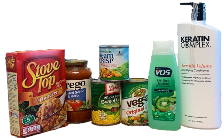
A photo of a few items that the FBLA association has been waiting to donate.

During the first semester of the school year, many of our students contribute in some way to helping either the school or the community. The school's student council holds a sock drive in October called Socktober. Socktober gives students and staff the opportunity to donate socks that, at the end of the month, will be given to different charities. Furthermore, the girls basketball team raises money by selling peaches throughout the community. Just about everywhere you look, you can find stu-