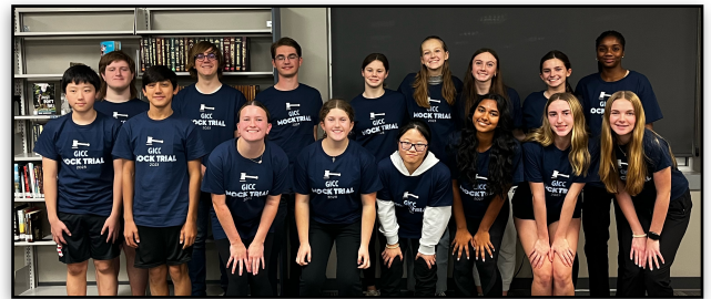
Members of GICC's two Mock Trial teams for the 2023-2024 school year pose for a team photo.