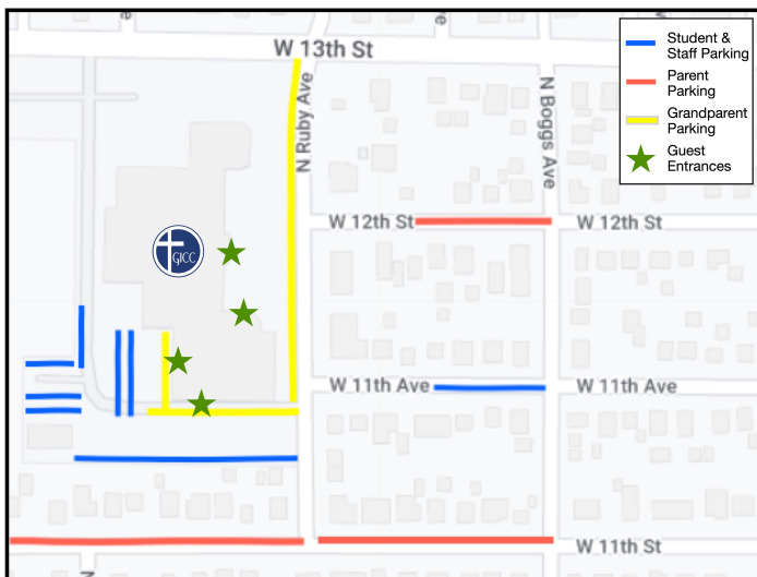
We appreciate our Crusader families cooperating with the parking plan and allowing our guests to park in the yellow spaces!

We still need parent volunteers for the GICC Food Stand fundraiser at Husker Harvest Days Sept 12-14, and clean up Sept 17.