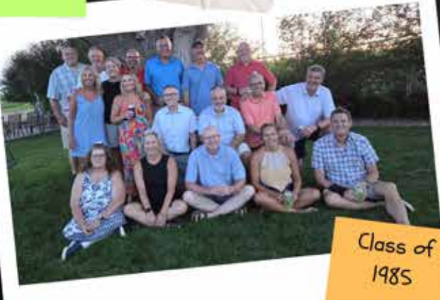
Class of 1985