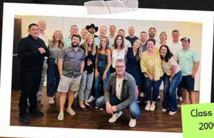
Class of 2000