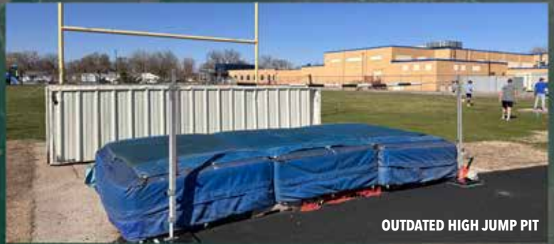
OUTDATED HIGH JUMP PIT