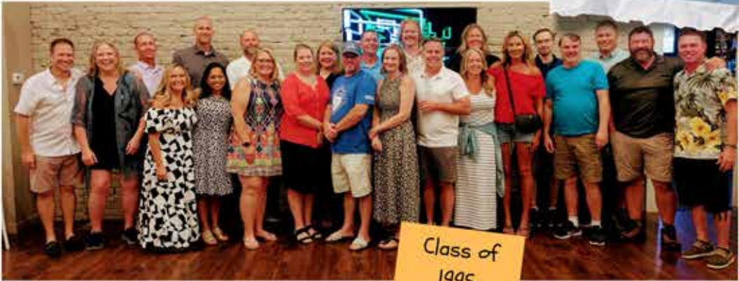
Class of 1995