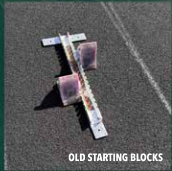
OLD STARTING BLOCKS