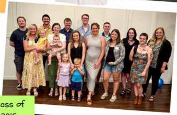
Class of 2015