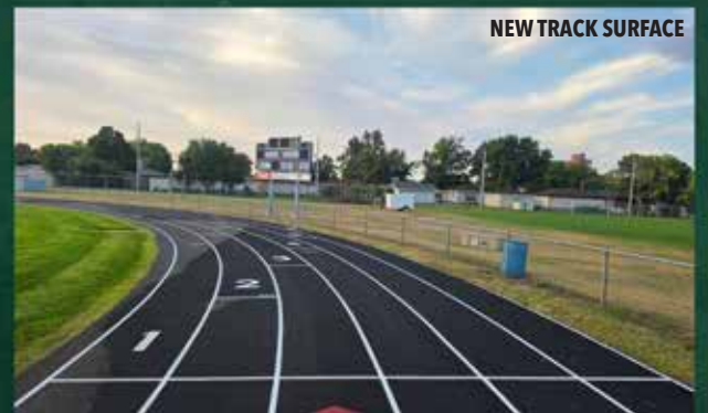
NEW TRACK SURFACE