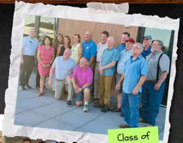
Class of 1980

HIGH SCHOOL REUNIONS BRING CRUSADERS BACK TOGETHER