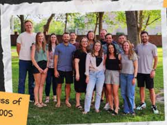
Class of 2005